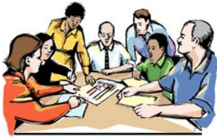
Congregational Resourcing Event