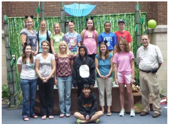
Thanks to our volunteers!

In addition to the Bible stories and Bible verses we