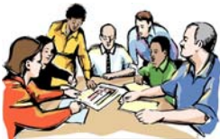
Congregational Resourcing Event