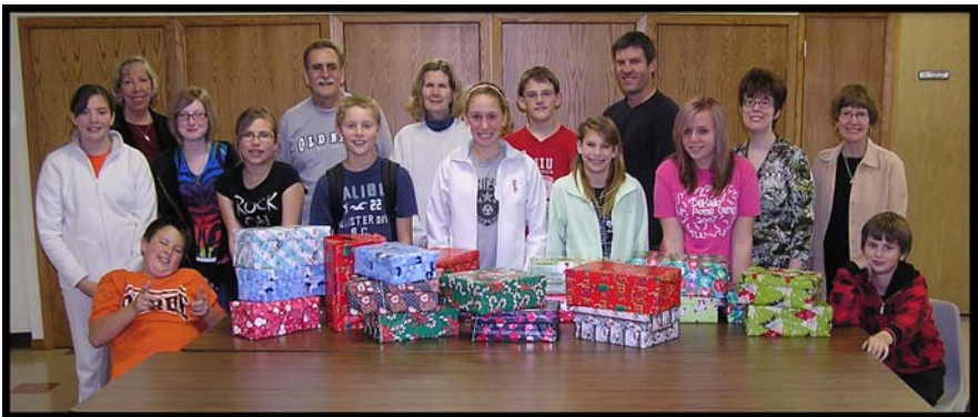
Seventh and eighth grade Faith Trek kids and their guides show off the shoeboxes they wrapped and filled for operation Christmas Child. Part of their faith formation program is participation in service projects that benefit our brothers and sisters in need.