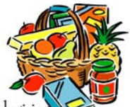
Thanksgiving Food Baskets

Our Middle School students will be packing Thanksgiving baskets for the Salvation Army! If you would like to help feed the hungry locally this Thanksgiving, please look for the ‘turkey’ in the Atrium and take some ‘feathers’ with needed items printed on them. You may drop off your food donations by the turkey or in the back of the Social Hall on or before Sunday, November 13! The items will be packed on Wednesday evening, November 16, by our confirmation students and delivered to the Salvation Army on Saturday, November 19. Items needed are: