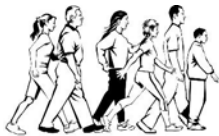
CROP Hunger Walk Sunday, October 23